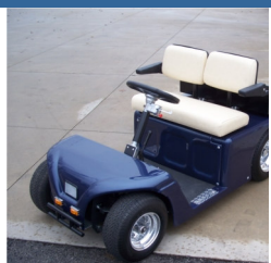
2 Person Seating