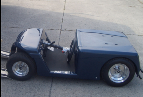
Collapsible Seats Remove Easily & Steering Folds into Floor Pan