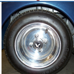
Polished Aluminum Rims