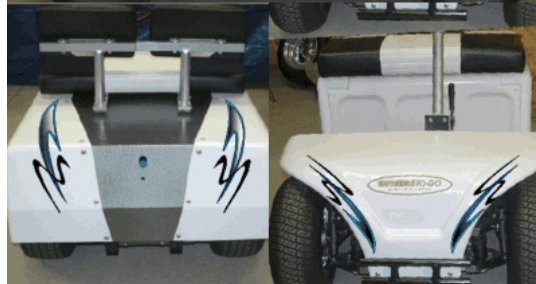
Custom Graphics Available