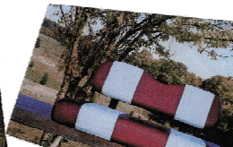
Ultra Two Tone White Quilted Insert with our Colors