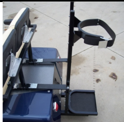
Single & Double Golf Bag Carriers