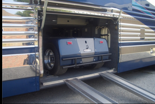
Fits into Most Bus Conversions, Some Unibody Motor Homes & 8' Elevators